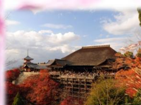
Kiyomizu - Kyoto

Millenniums of history as ancient capitals -Seoul, Kyoto