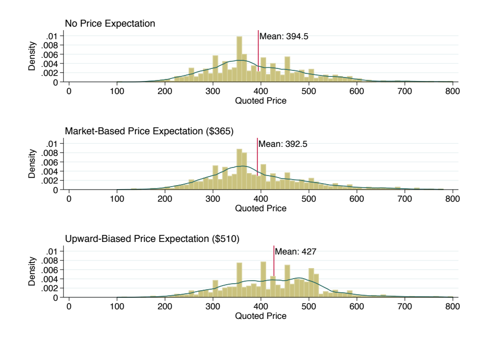
Figure 1: Main experiment: Distribution of price quotes by condition