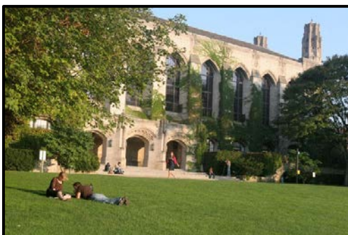
Students take a break in front of Northwestern University Library (left)

Kellogg School of Management Doctoral Program Northwestern University 2001 Sheridan Road Evanston, IL 60208 United States