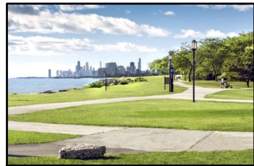
A view of Chicago's skyline from the Evanston Campus

Kellogg also has a campus in Miami (Kellogg-Miami Campus) that combines the resources of a top-ranked business school with the convenience of being located in the financial center of the southeastern United States and the gateway to Latin America.