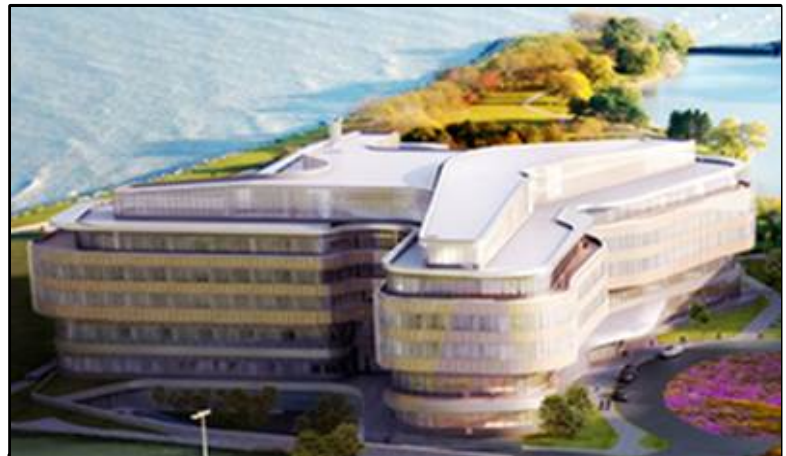
A rendering of the new business campus along Lake Michigan - the future home of the full-time PhD and MBA programs.

Northwestern University Library is one of the largest university libraries in the United States, and it is 11th in holdings among US private universities. It has more than 6.2 million print and electronic volumes and 179,632 print journals and 158,013 electronic journals, and more than 900 databases – more than 90% are accessible electronically. There are 133 terabytes of unique digital content (NUL). Other libraries on the Evanston campus often used by Kellogg students are the Mathematics Library and the Seeley G. Mudd Science and Engineering Library. Students also have access to other excellent libraries in the Chicago area through the Reference Department and to specialized materials throughout the world through the Interlibrary Loan Department.