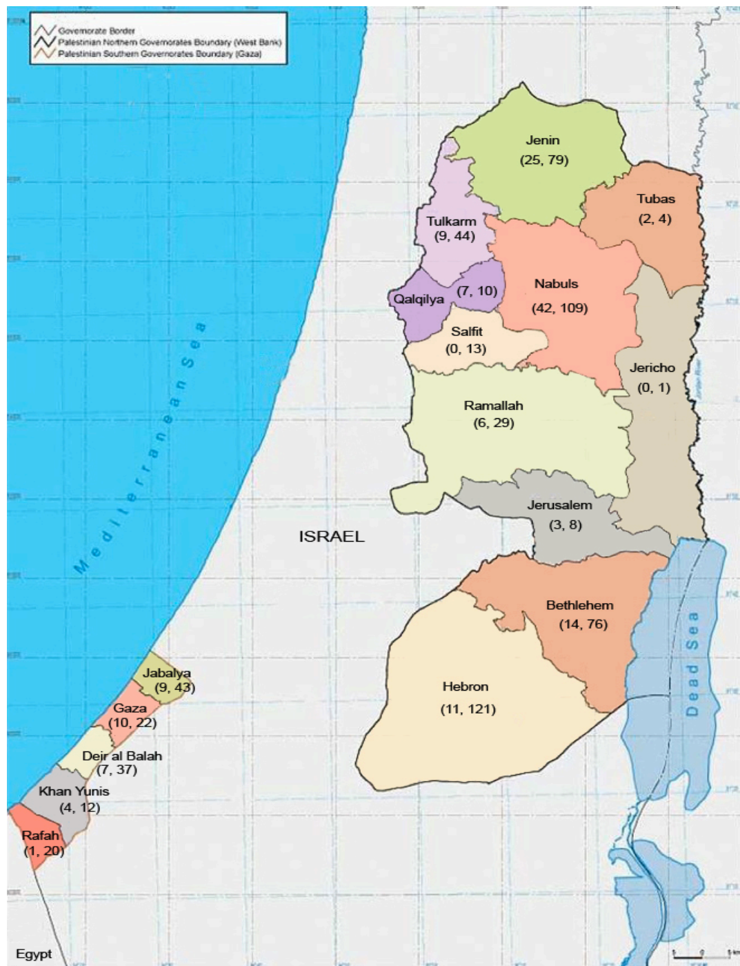
Figure 1. Suicide terrorists and house demolitions, October 2000–December 2005