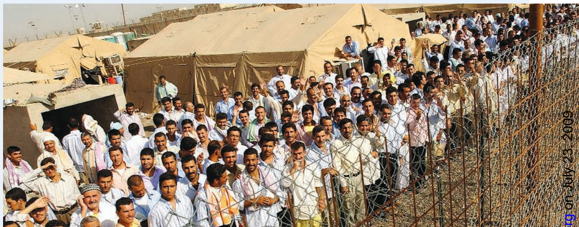
Analytical fodder? A former U.S. official alleges that innocent people in Iraq and Afghanistan were interrogated to feed data into terrorist network models.

nois. "All powerful methods grow a dark side. Their power is eventually used irresponsibly. I think the real fear here is that a method that has a reputation for finding new insights is falsely used." -J.B.