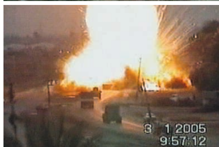
Deadly clues. Researchers have struggled to model the Iraqi insurgent networks behind IED attacks.

work model grows, the noisier its gets—and “the less you see.”