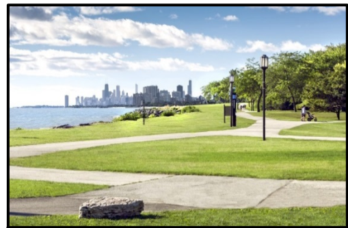
A view of Chicago's skyline from the Evanston Campus

Kellogg also has a campus in Miami (Kellogg-Miami Campus) that combines the resources of a top-ranked business school with the convenience of being located in the financial center of the southeastern United States and the gateway to Latin America.