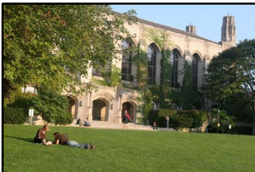
Students take a break in front of Northwestern University Library (left)

Kellogg School of Management Doctoral Program Northwestern University 2001 Sheridan Road Evanston, IL 60208 United States