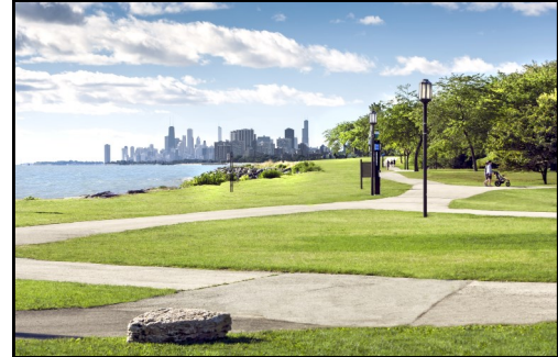
A view of Chicago's skyline from the Evanston Campus

Kellogg also has a campus in Miami (Kellogg-Miami Campus) that combines the resources of a top-ranked business school with the convenience of being located in the financial center of the southeastern United States and the gateway to Latin America.