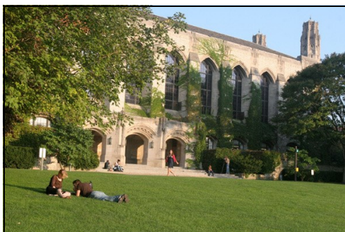
Students take a break in front of Northwestern University Library (left)

Northwestern University Library is one of the largest university libraries in the United States, and it is 10th in holdings among US private universities. It has more than 5.4 million volumes and 94,163 current periodicals and serials, more than 700 databases – more than 90% accessible electronically and 6,000 electronic journals. More than 73,000 e-books were added to the Library's collection in 2010, and there are 22 terabytes of unique digital content (NUL). Other libraries on the Evanston campus often used by Kellogg students are the Mathematics Library and the Seeley G. Mudd Science and Engineering Library. Students also have access to other excellent libraries in the Chicago area through the Reference Department and to specialized materials throughout the world through the Interlibrary Loan Department.