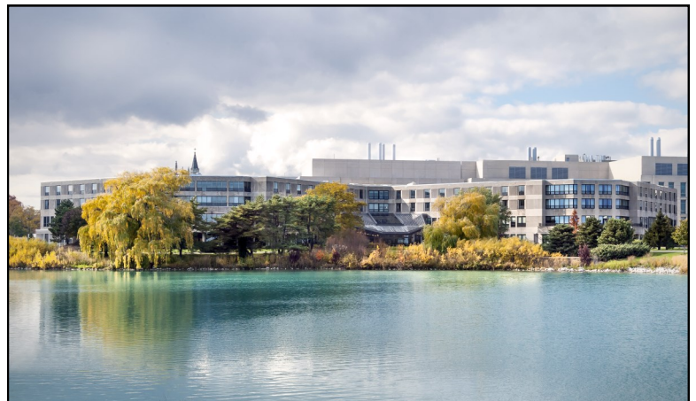
A view of the James L. Allen Center, Kellogg's Executive Education and Conference Center, from The Lakefill, Northwestern's 74-acre peninsula on Lake Michigan.

Kellogg's Research Computing Department supports faculty and doctoral students in their research. Research Computing manages the research resources and facilities available at Kellogg that include supporting their use, educating users, and troubleshooting in statistical computing.