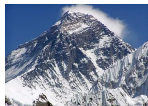
Mt. Everest (Nepal)