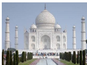
Taj Mahal (Agra)