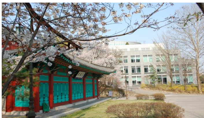
Spring in SKKU (Bicheondang & International Hall)

Health Insurance: $400 per semester (may be waived, provided the student has his/her own health insurance)