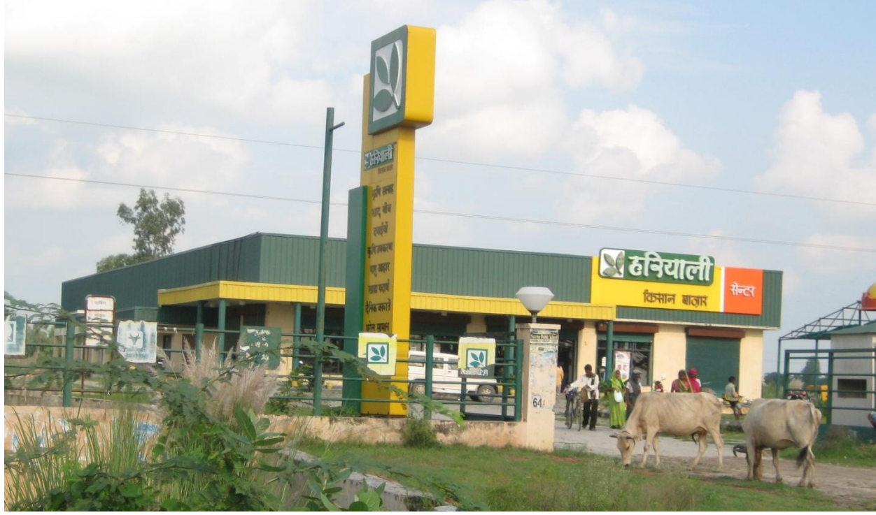
Exhibit 4. A hypermart in rural India.

However, if a company does not have a product and brand that already enjoys immense pull from the market, it is risky to build out an expensive custom distribution system before the first product has been sold. As Kashyap at MART, a leading rural marketing consulting firm in India, says, large companies are "incurring huge costs" to distribute their products into rural areas of India and they are finding it challenging to "design a distribution model that is cost effective."