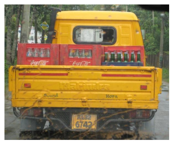
Exhibit 3. An auto-rickshaw delivers Coca-Cola in a rural Indian village.

Coca-Cola set up "Manual Distribution Centers" in which "an independent person was given the rights to distribute Coca-Cola products within a defined radius" <sup>14</sup>. Similarly, in India local entrepreneurs sell Coca-Cola using "all possible means of transport, ranging from trucks, autorickshaws, cycle rickshaws and hand carts, to even camel carts in Rajasthan and mules in hilly areas, to transport its product from the nearest hub." (See exhibit 3) As Colgate and Coca-Cola have shown, the hub-and-spoke model for FMCG products works well because it addresses the inventory cost and transportation infrastructure issues that are associated with distributing products in rural emerging markets while also providing for good product availability at the small-village level.