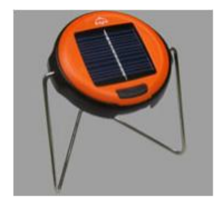
Exhibit 10C. The S1.