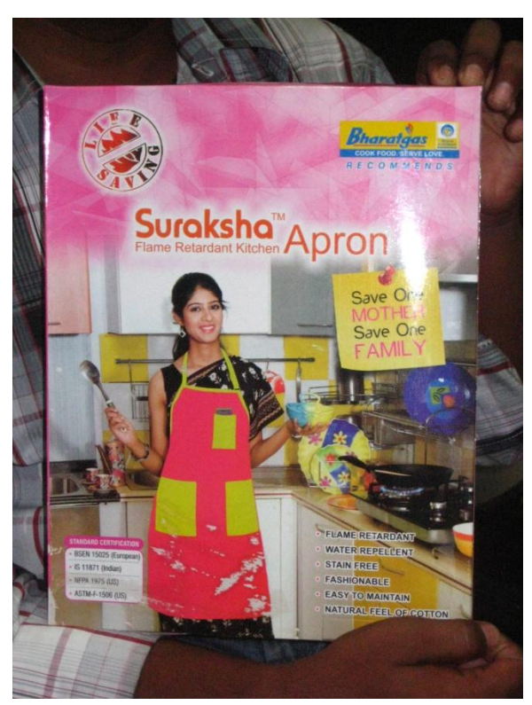
Exhibit 5. An apron with the Bharat Petroleum brand on the package.

Companies seeking to build brand trust in rural emerging markets can also piggyback on the brands of trusted corporate retailers, similar to what Whirlpool did with Sony in Japan. In rural India, ITC is a trusted brand that operates large hypermarts called "Choupal Sagaars". When a consumer sees a brand stocked in a Choupal Sagaar, the brand receives the consumer's trust because of its association with ITC. Bharat Petroleum, the second largest oil company in India and a trusted brand among consumers, also has rural retailers that stock consumer brands. When providing products to these retailers, many companies go so far as to co-opt the trusted "Bharat" brand name and put it on their own product packaging (see the top right of exhibit 5). Piggybacking on the trust that rural consumers place in local and corporate retailers can provide much needed credibility and trust for a new and unknown brand.