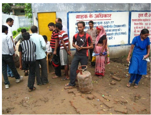
Exhibit 12. Customers picking up LPG cooking gas from a BPCL retail store.

cooking stoves, pots and pans, aprons, tea, and crackers (See exhibit 13).