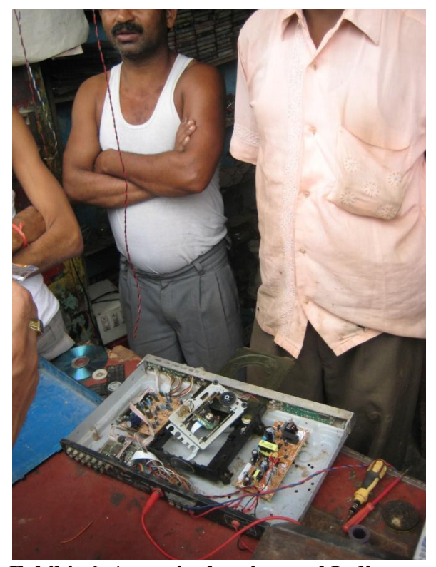
Exhibit 6. A repair shop in rural India.

quality of the after-sales service experience that customers receive cannot be explicitly controlled. On the other hand, Tecnosol, as described above, sends employees deep into rural areas to make product repairs. In contrast to TERI, Tecnosol is guaranteeing that its customers receive a quality aftersales service experience, but the company also faces higher costs from its operations.