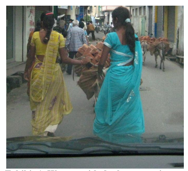
Exhibit 1. Women with donkeys carrying bricks blocking traffic in a rural Indian village.

To further confirm the lack of good transportation infrastructure in India, Pradeep Kashyap writes in "The Rural Marketing Book" that "68 per cent of the rural market [in India] still lies untapped primarily due to inaccessibility," and C.K. Prahalad offers further insight beyond the borders of India when he writes more generally that "access to distribution in rural markets continues to be a problem."