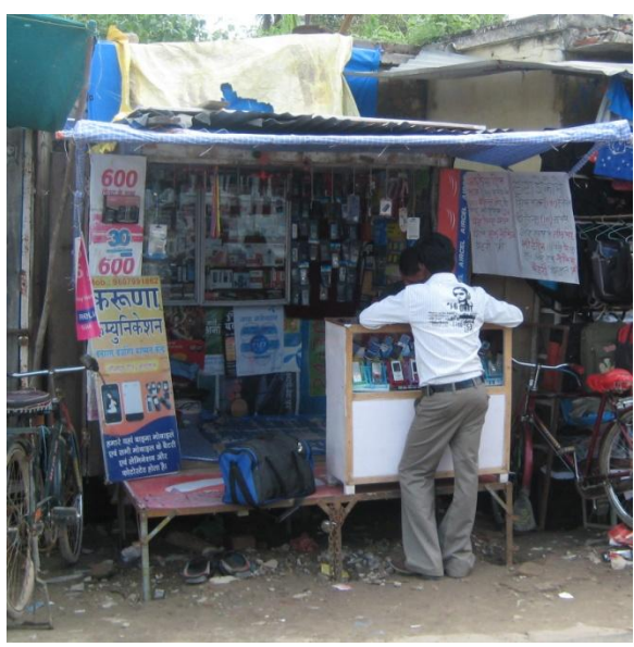
Exhibit 2. A typical retail store in a rural Indian village.

its oral care products. The company had experimented with stocking retailers in very small villages, but found that its traditional sales force-driven model was not economically feasible in geographically dispersed villages with low levels of demand. Colgate decided to hire local entrepreneurial youth to distribute its products in villages and at weekly markets called haats. The youth bought Colgate products with cash from a local distributor, and then biked within a 10 kilometer radius selling the products to villagers. Although Colgate payed the youth a small stipend, they received less margin than a professional sales person would have and they reduced Colgate's inventory costs.<sup>13</sup>