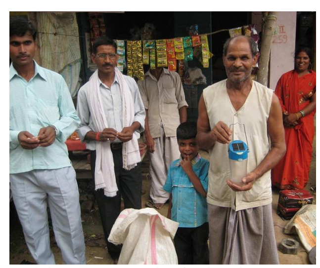
Exhibit 8. A rural Indian family with their d.light lamp.