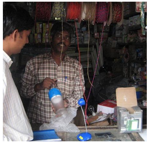
Exhibit 11. A rural retail store owner with a d.light product.

through a network of third-party warehousing and distribution logistics companies (See exhibit 11). The warehousing companies would store d.light product inventory in UP and then ship the products to retailers when the retailers' stocks were low. d.light undertook almost no consumer education and marketing efforts in UP to create demand for its products.