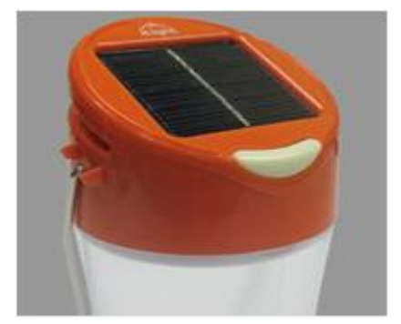
Exhibit 10B. The S10.