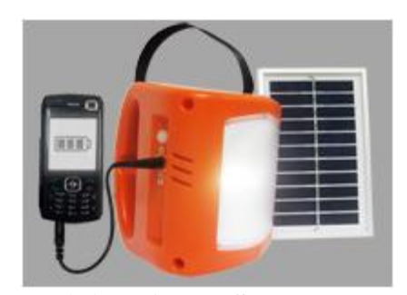
Exhibit 10A The S250.

Besides the product features, all of the lights come with a product warranty of up to one year. The lights are designed to last for three to five years, and the rechargeable batteries need to be replaced about every two years.