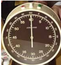
Figure 1: The stopwatch. (No rights obtained!)

The German UMTS-Auction in August 2000 attracted, like similar auctions in Great Britain and The Netherlands earlier in the year 2000, a lot of public attention and money. At this auction 4 to 6 licenses to offer third generation cell-phone service in Germany were on the block to be sold, raising a total revenue of 98,8072 BDM. The publicity surrounding the auction is as good an excuse as any to outline the mathematics underlying the design of auctions and the light it sheds on the German UMTS-Auction. (Here UMTS is short for Universal Mobile Telecommunications System.) A useful starting point is the auction organized by the Regulatory Authority for Telecommunications and Posts (RegTP) 1 to sell the stopwatch which was used during the UMTS-auction. The proceeds of the auction go to charity. 2 RegTP