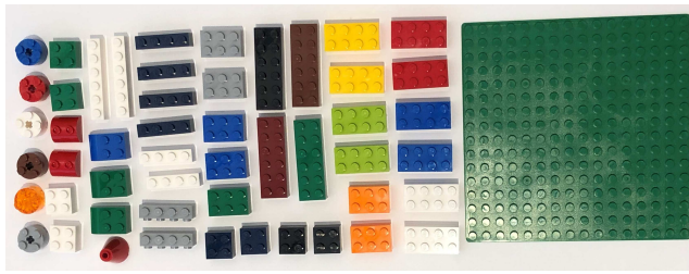
FIGURE 1: Lego blocks and base used in Study 1.

where she would sit (henceforth, the experimenter's table). In the limit condition ( N = 25 ), the experimenter added, "I am sorry, but you can only play for 10 minutes." The experimenter did not add this sentence in the control condition. The experimenter then gave the child a green base and a bag with 51 Lego blocks in 12 colors (see Figure 1).