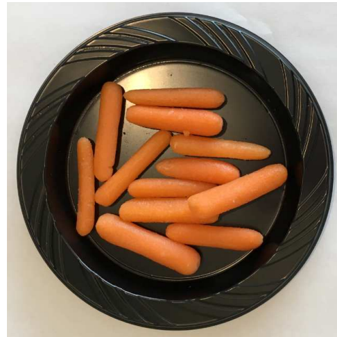
FIGURE 2: Carrots served in Study 1.

Children played longer when they were told they had limited time to play. On average, children played 494.04 seconds