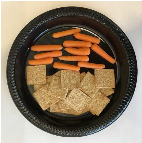
FIGURE 5: Food served in Study 2.