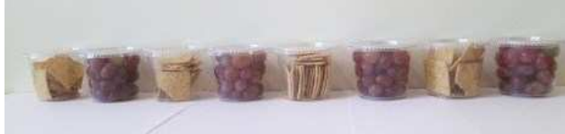
FIGURE 6: Choice Sets Used in Study 3.

After the child made a choice the experimenter recorded which container the child chose, and this served as our dependent variable. The child then completed several tasks, 7 received the chosen snack container as a gift, and returned to the classroom.