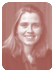
Board Member Biography