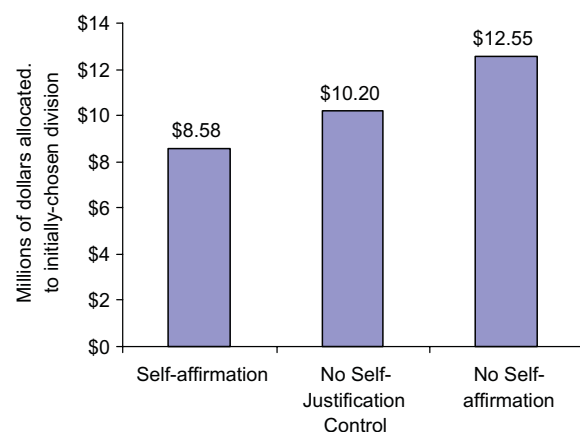
Fig. 2. Amount of money allocated in the 2nd choice towards the division initially-chosen in the A&S decision case.

To ensure that our effects were not driven by systematic differences in the specific values participants chose as most or least important, we conducted a number of different analyses examining these choices. An initial analysis on preference-ratings for the entire sample revealed that none of the six different values was ranked as most important more frequently than any of the others, \chi^2(5, N = 38) = .72, p = .21 . An additional analysis on differences in participants' preferred values between the affirmation and non-affirmation conditions also revealed no significant differences, \chi^2(5, N = 38) = .74, p = .98 . Furthermore, separate analyses on participants' value rankings within the affirmation, \chi^2(5, N = 18) = 2.0, p = .85 , and no-affirmation, \chi^2(5, N = 20) = 4.0,